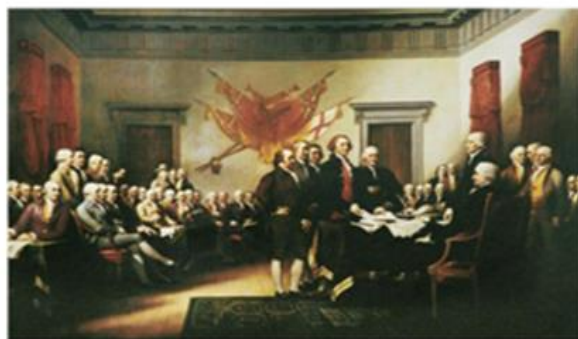
July 2, 1776, The Declaration of Independence was signed by men including John Adams, Benjamin Franklin, and Thomas Jefferson.

On June 28, 1776, the draft of the Declaration of Independence was read to Congress for the first time. Over the period of July 1-4, delegates debated over